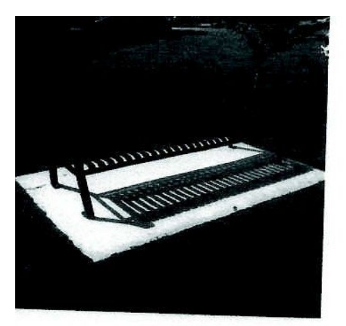
Proposed Bench $898.00 each