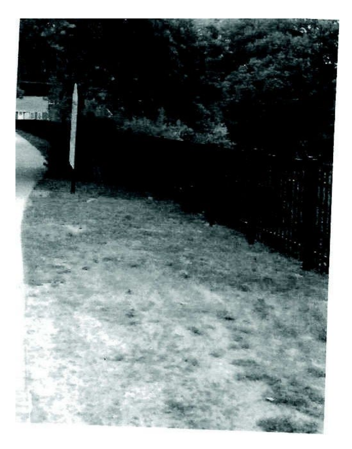
Esplanade near Falls