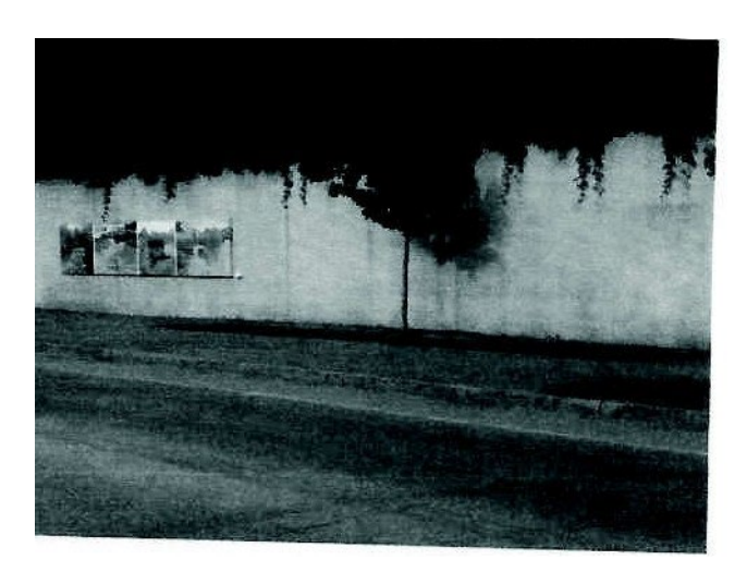
Art Wall - Main Street