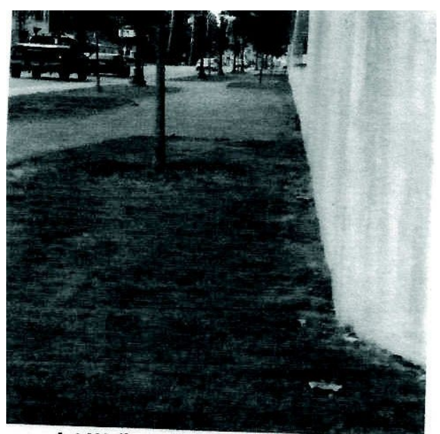
Art Wall – Main Street Art Wall - Main Street